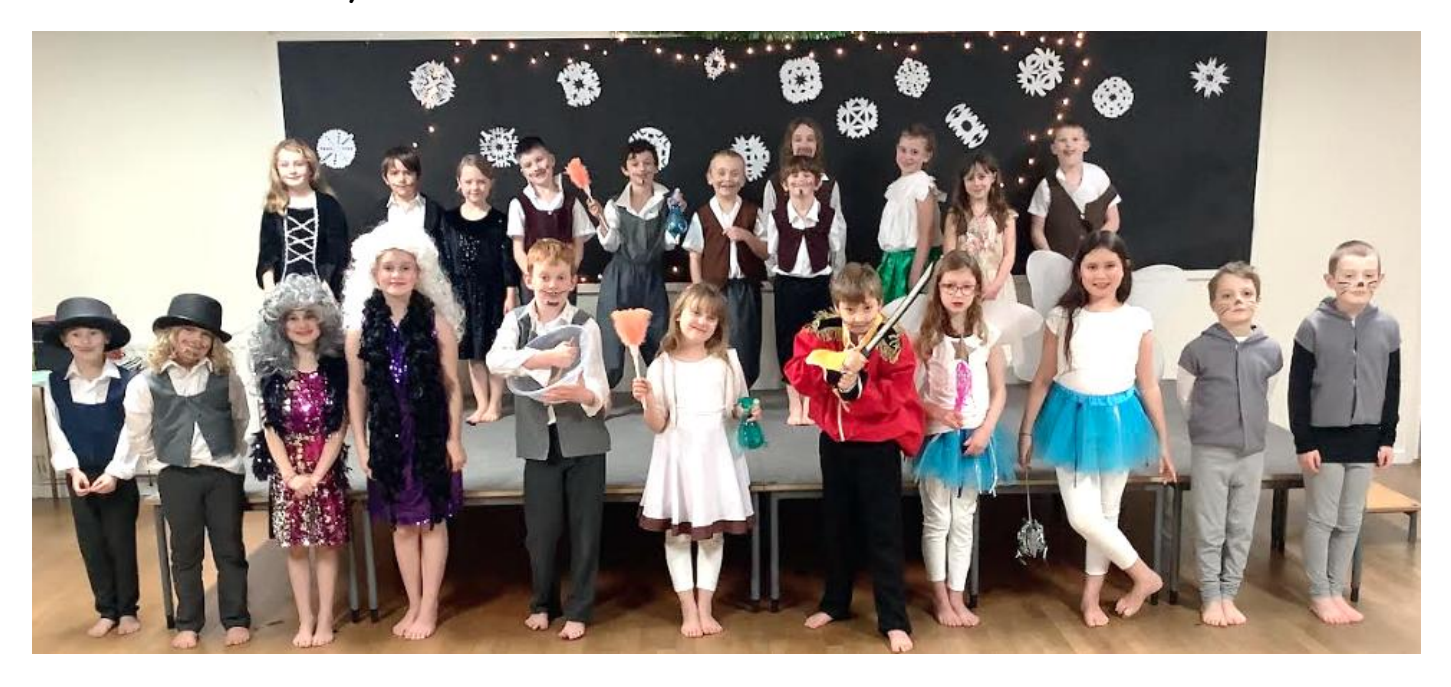
Years Five and Six, 'Hansel and Gretel'