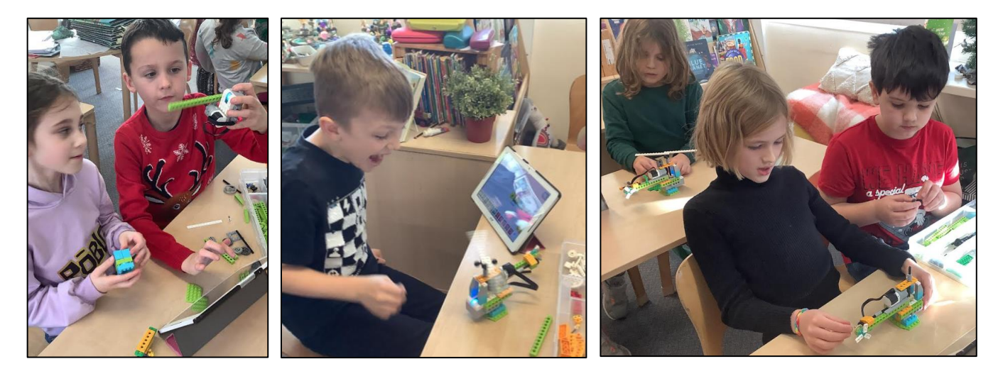
Years Five and Six, Lego Robotics Workshop

Class Two worked co-operatively to create spinning models with axels. They then wrote and debugged algorithms to make their Lego models move. The children were wholly engaged working together as engineers.