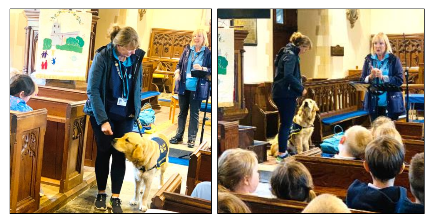
Years Two, Three, Four, Five and Six, Theatre Alibi "The Parcel"

The children enjoyed meeting Zag, a guide dog in training.